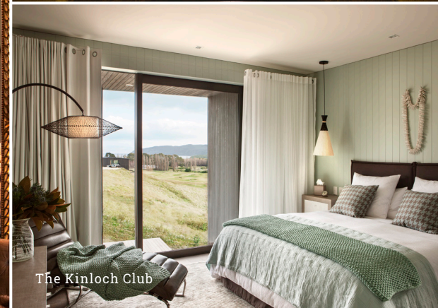
The Kinloch Club