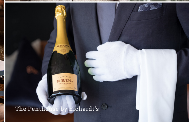
The Penthouse by Eichardt's

strongest growing market segment worldwide. They report a 48 per cent increase in the last five years, with luxury travel growing twice as fast as all other types of international tourism (at 24 per cent).*