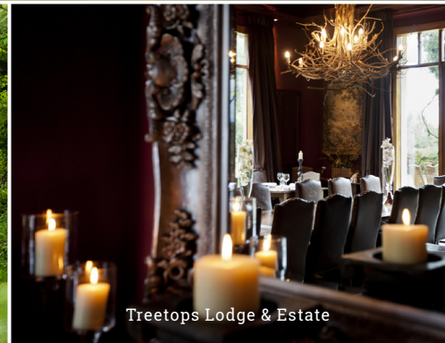
Treetops Lodge & Estate