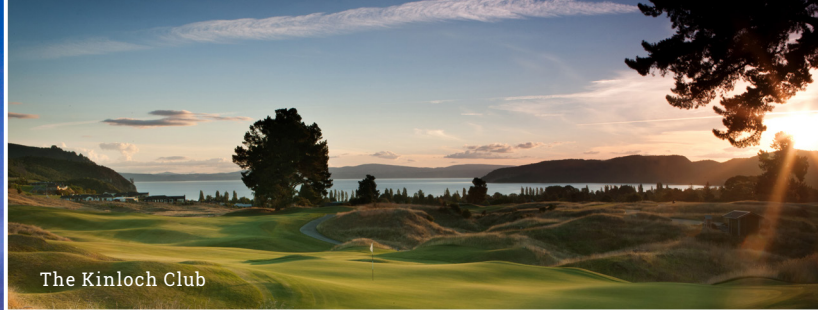
The Kinloch Club