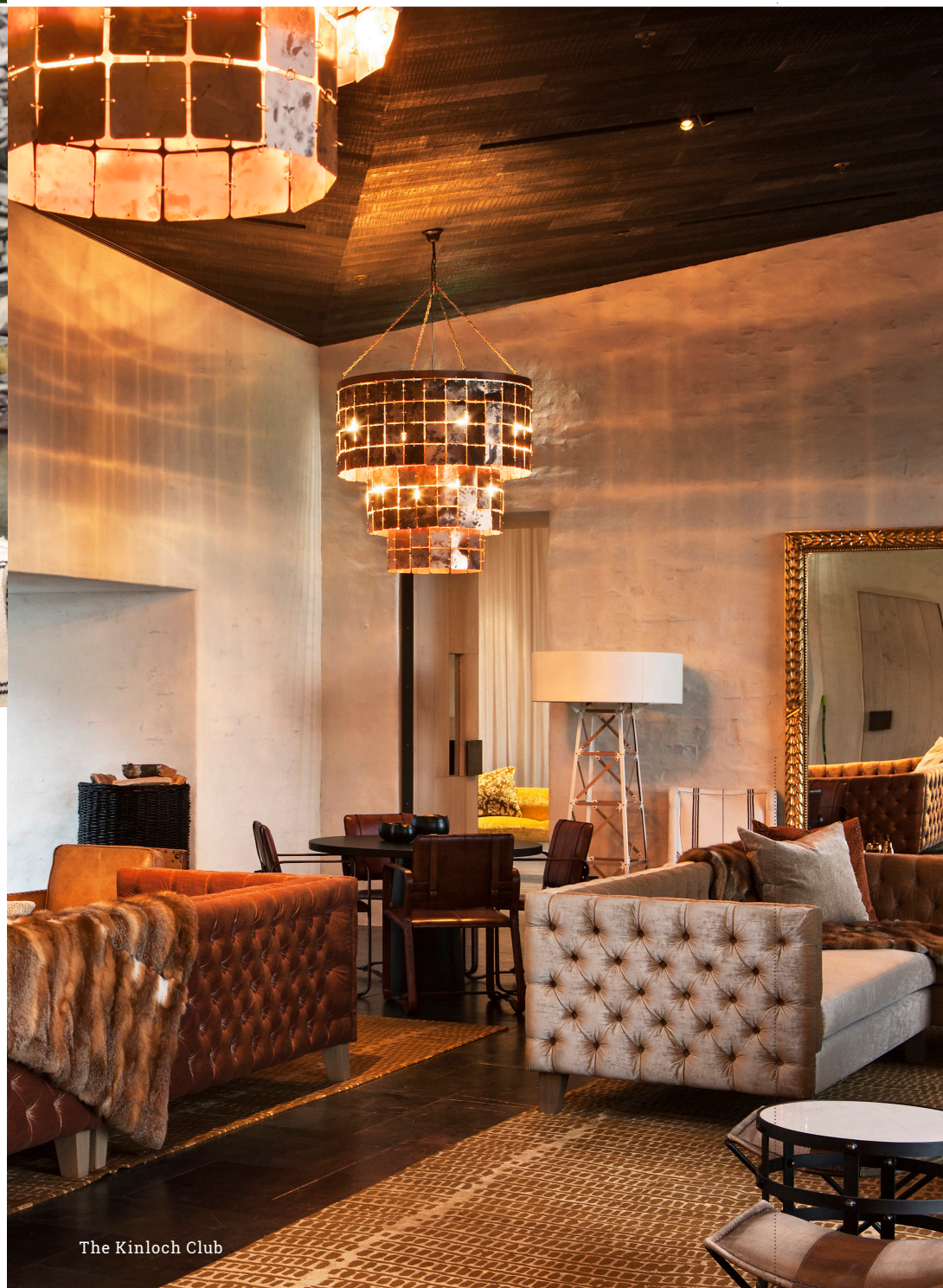
The Kinloch Club