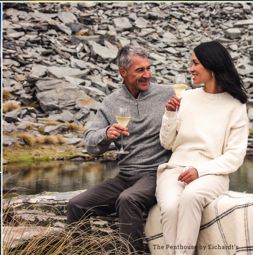
The Penthouse by Eichardt's