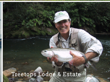
Treetops Lodge & Estate